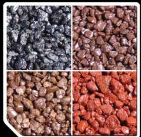
colorized: CRUSHED 3/8" GRAVEL-LOK CLEAR BOND