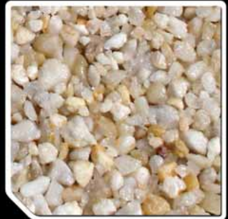
size: 3/8" CRUSHED GRAVEL-LOK CLEAR BOND