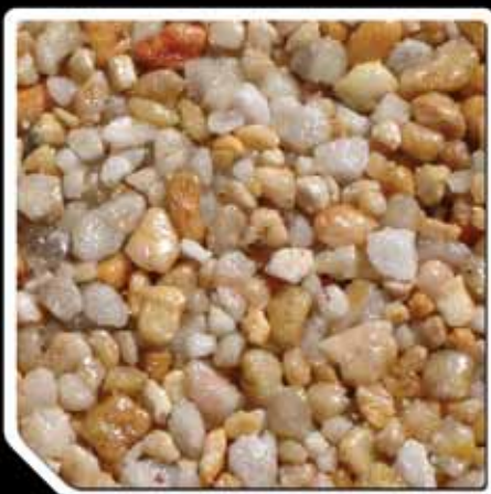
GRAVEL-LOK CLEAR BOND