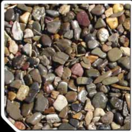
size: 3/8" RIVERJACK GRAVEL-LOK CLEAR BOND