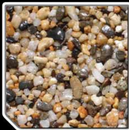
GRAVEL-LOK CLEAR BOND