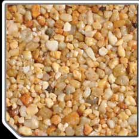
size: 3/8" PEA GRAVEL-LOK CLEAR BOND